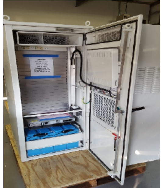
Full Equipped Cabinet